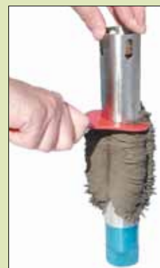
Cleaning the core